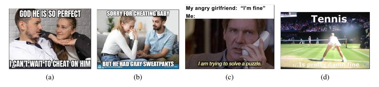
Figure 4: A sample of false negatives from the test set on the misogyny identification task.

score composed of a promising 75% in precision and 71% recall. While performance between stereotype and objectification are close, the system underperformed in the shaming category. We think this behavior is due to the broad kind of both visual and textual content that can convey shameful messages and is hence more difficult to learn. Finally, the model performed best in violence , where it is probably simpler to identify visual clues that let intend a violent message.